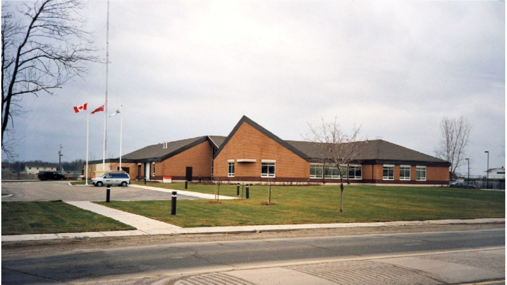
Niagara Regional 33 Division Police Station Welland, Ontario